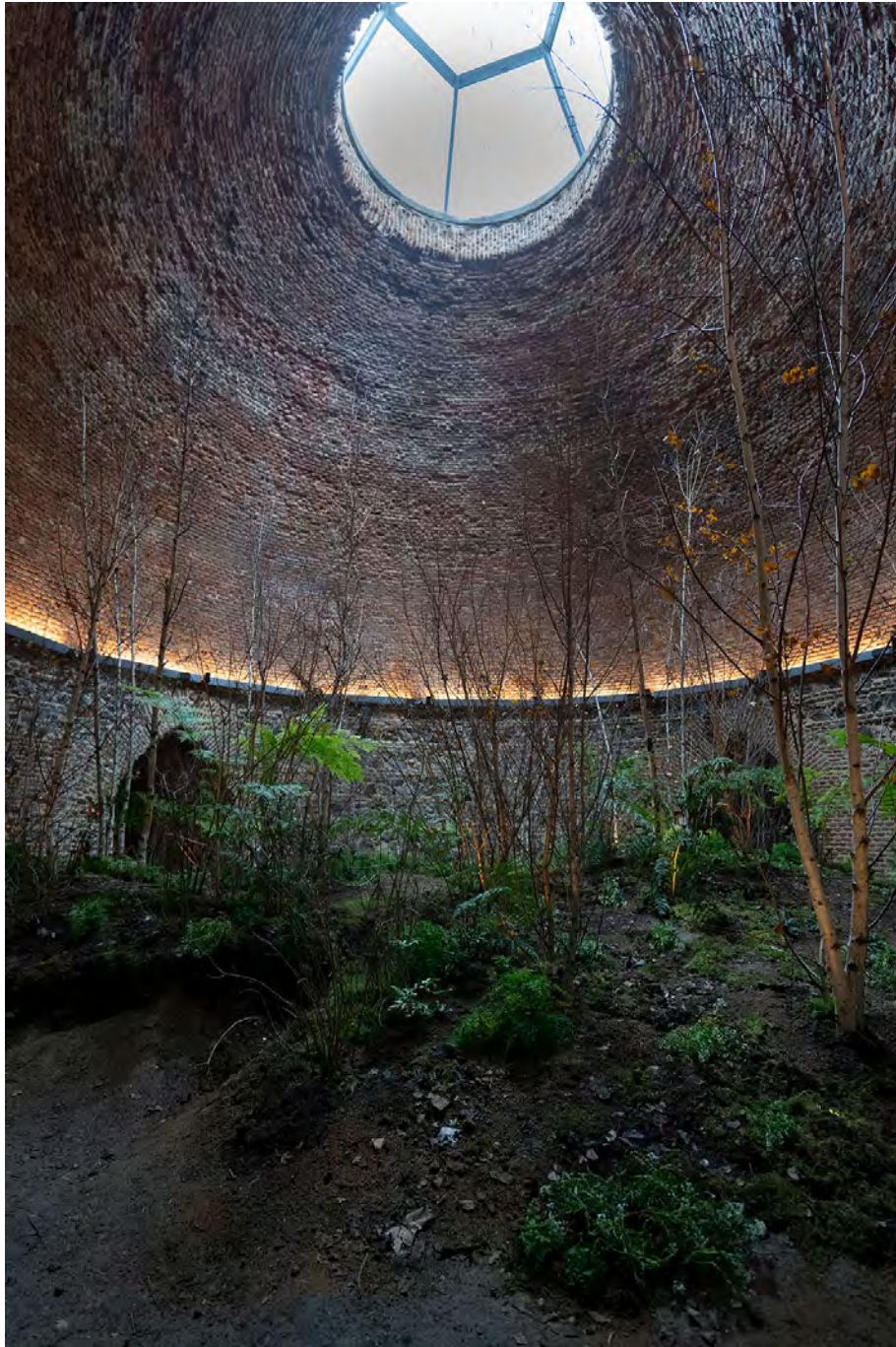
When the Lambs Rise Up Against the Bird of Prey is on view till April 3, 2024, Precious Okoyomon

Curated by Hans Ulrich Obrist, the setting is special: the Montaña Artificial, also known as the Montaña de los gatos ("Cat's Mountain" as the people of Madrid are popularly referred to as cats), is a place that was abandoned and closed for 20 years. It was on a whim that King Fernando VII ordered it to be built in the 19th century as a creative and recreational space in El Retiro Park. After passing through the entrance gate, a narrow, brick-walled corridor leads to the centre of a domed, conical, mountain-like construction.